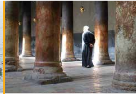
CHURCH OF THE NATIVITY