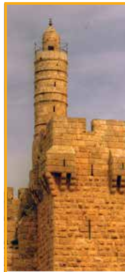
TOWER OF DAVID

Depart Jerusalem and drive south. Stop at Nebi Samuel, the traditional tomb site of the prophet Samuel. Drive through the Tzora and Eshta'ol, the region where Samson battled the Philistines. Stop at Tel Azekah, an Israelite military outpost, from which we'll view the Sorek Valley and the Elah Valley, where David slew the giant Goliath with only faith and a sling-shot. Continue to the Beit Guvrin-Maresha National Park, where we will take up our bicycles for a cycle through history. The park encompasses approximately 1,250 acres of rolling hills in the Judean Lowlands. The hills consist mainly of chalk overlaid with harder nari limestone. For thousands of years, people have been cutting quarries, burial caves, storerooms, industrial facilities, hideouts and dovecotes into the soft chalk layer.