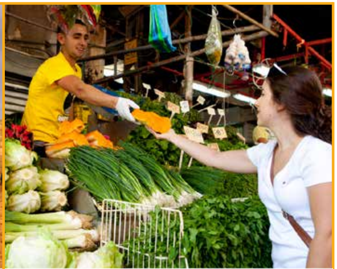
MACHNE YEHUDA MARKET